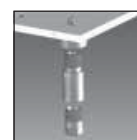
Hygienic scoop holder