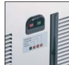
Front ON-OFF Switch Storage bin antibacterial pouch & holder